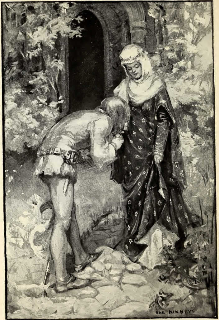
YOU ARE LIKE A STAR UPON MY PATH